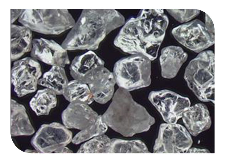
Sugar crystals under EVO Cam II (100x magnification)